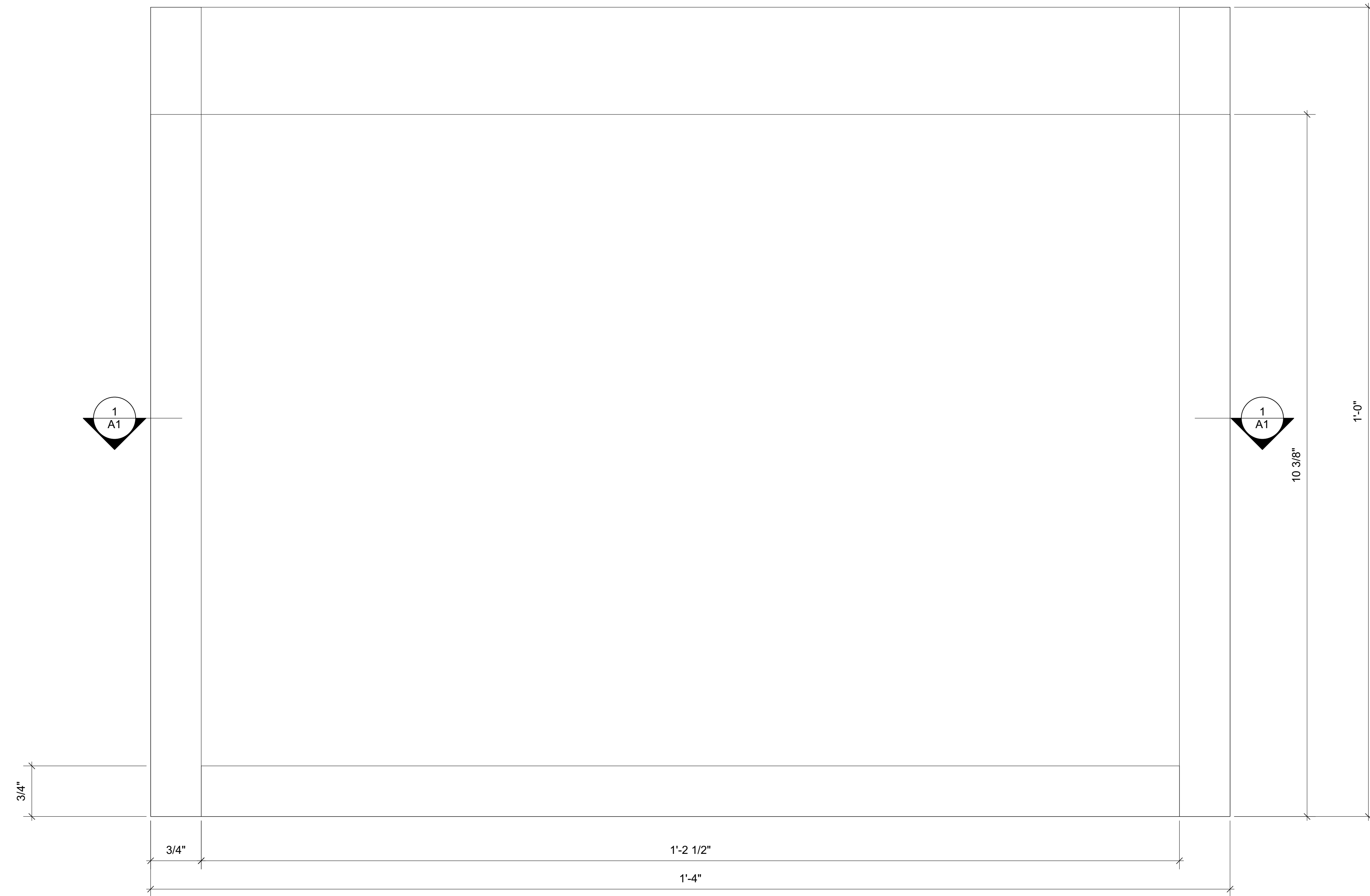
2 Front View Scale: Actual Size